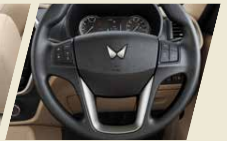
Tilt steering with mounted controls.