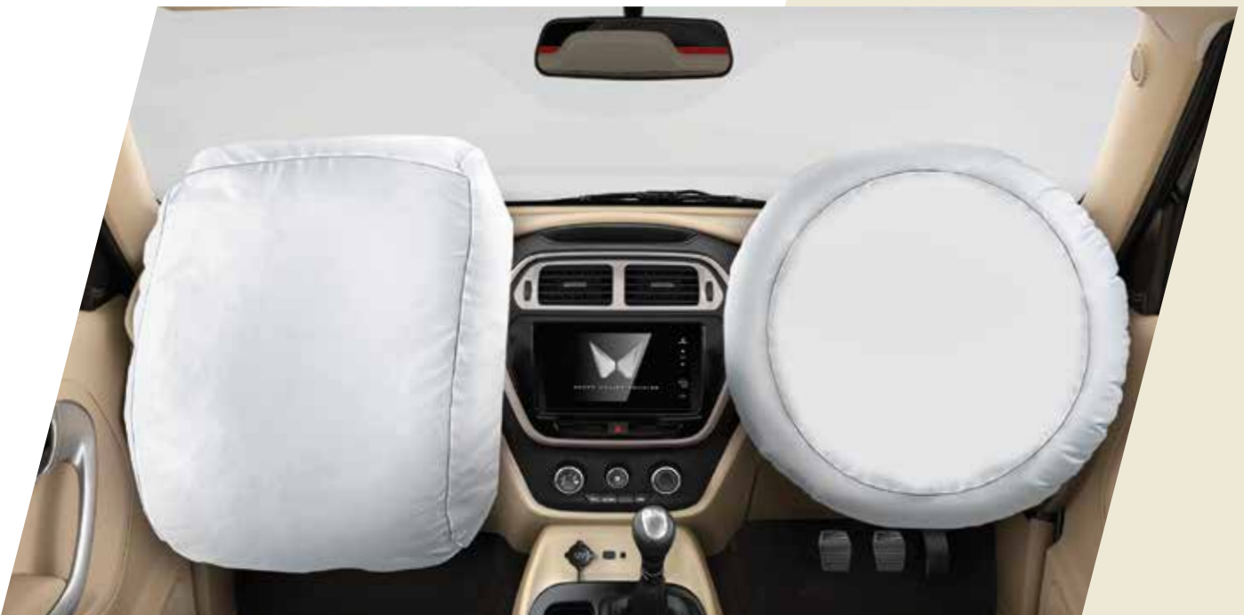
Dual airbags for driver and co-driver