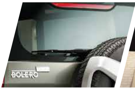
Rear wash and wiper with defogger