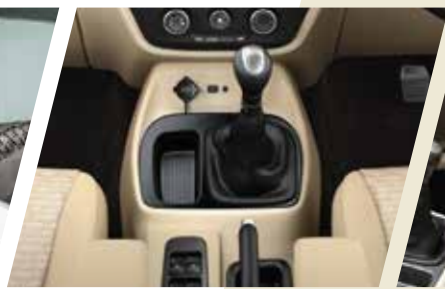
Premium center console