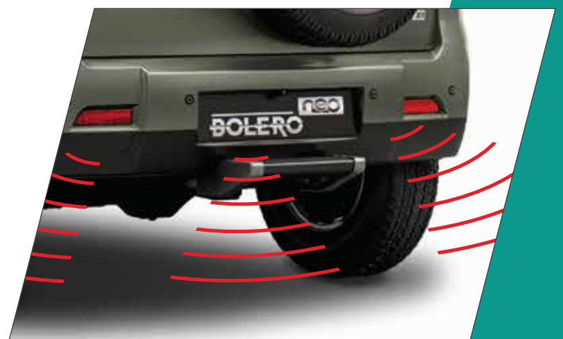
Intellipark reverse assist