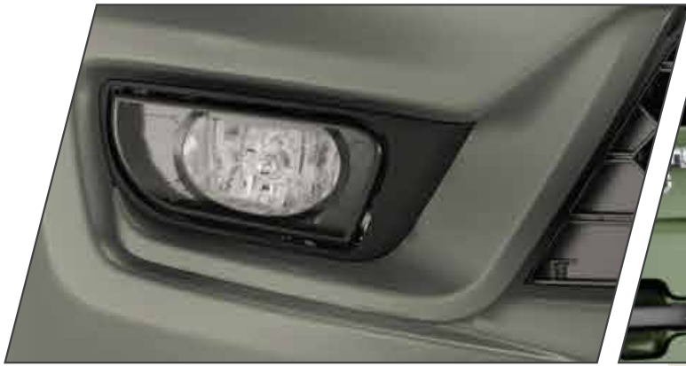
Stylish fog lamp