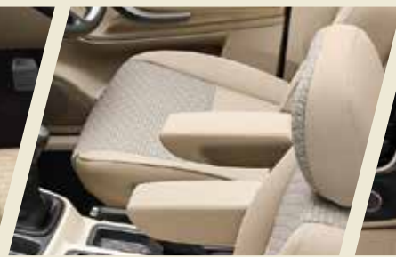
Armrests in the front and middle rows