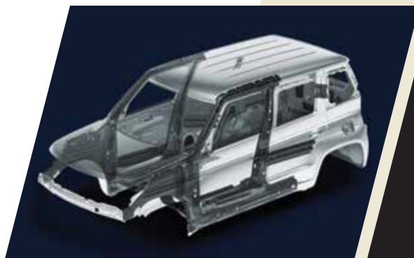
High strength steel body shell