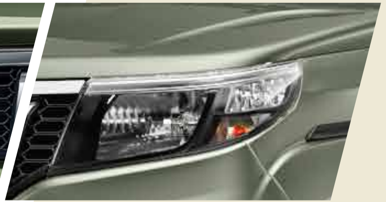
Sporty headlamps with DRLs