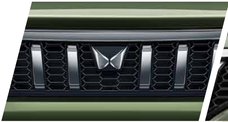
Bolero family grill with chrome inserts