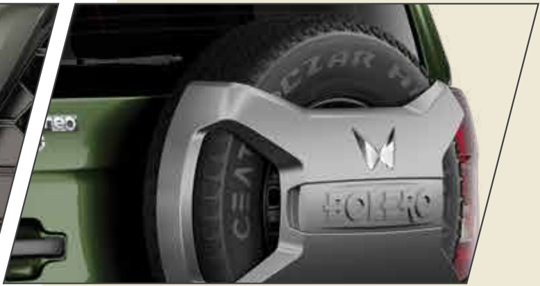
Signature Bolero branding on spare wheel cover